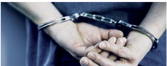
The intruder is apprehended before any damage is done. The entire process is monitored by the operations centre.